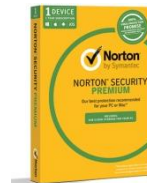
3YR INTERNET SECURITY